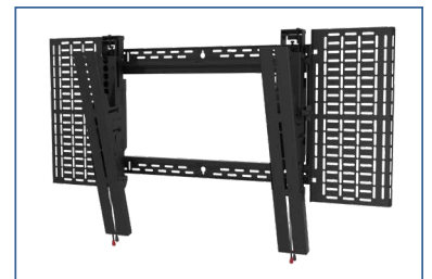
Shown with (2) optional ACC-UCM2 Universal AV Component Mounts