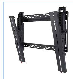
Fully adjustable +15/-2° tilt with IncreLok™